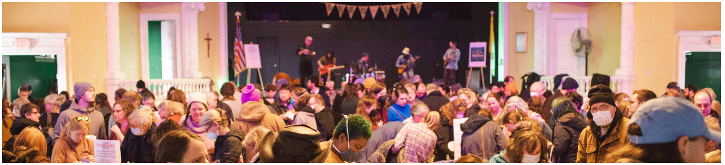
Cleveland Seed Bank