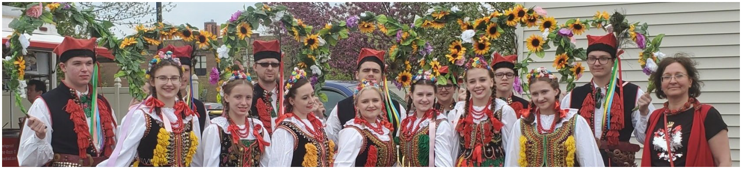
Polish Village Parma