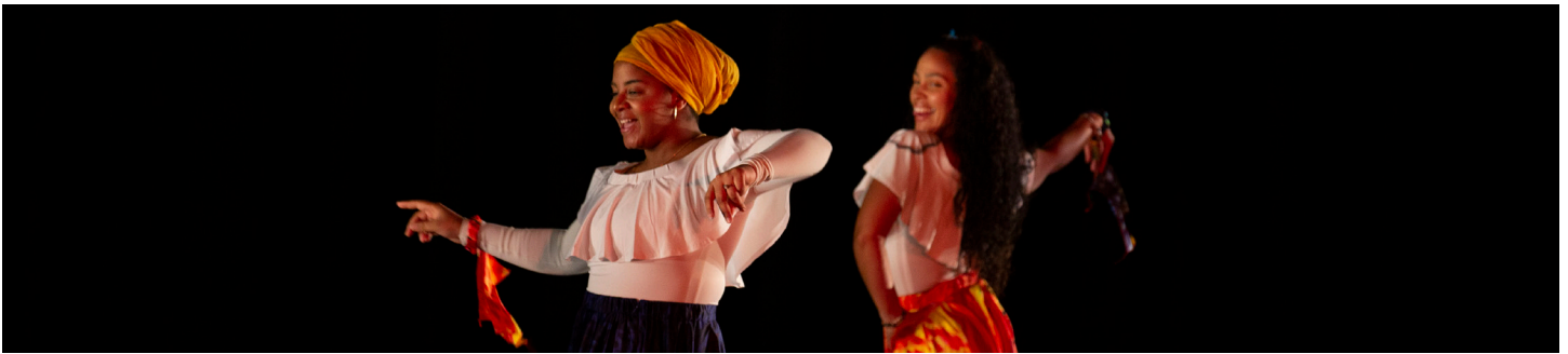
The Movement Project, Photo by Credit Black Valve, Artist Caribe Conexión