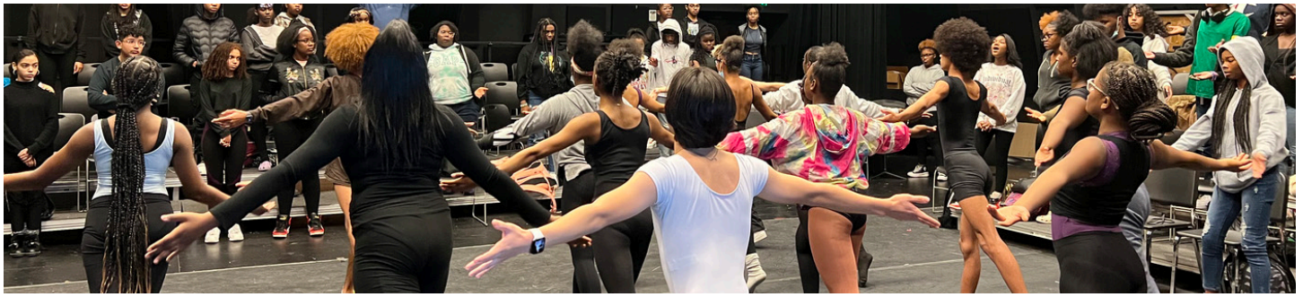
Cleveland School of the Arts Board of Trustees