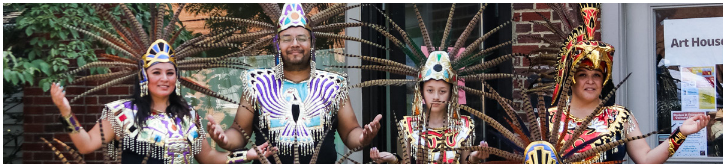
Art House - Big Read Kick off