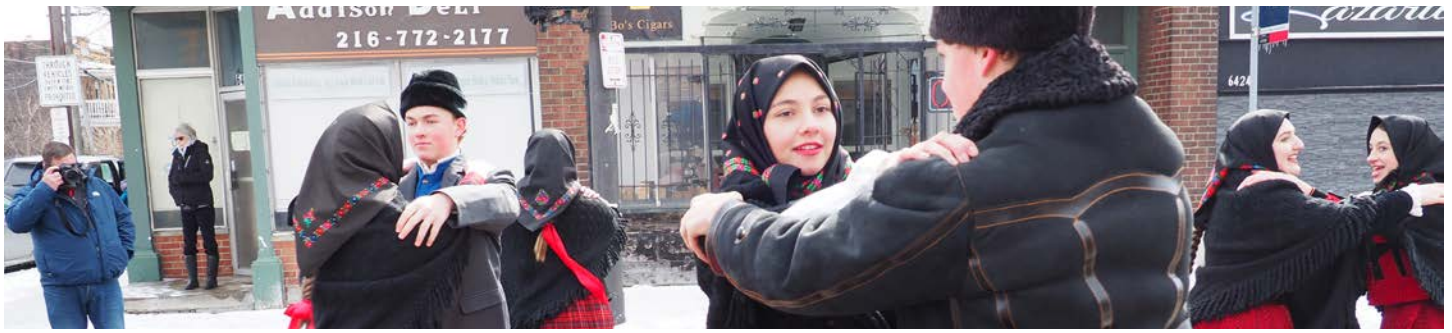
Slovenian Museum and Archives - Cleveland Kurentovanje Festival