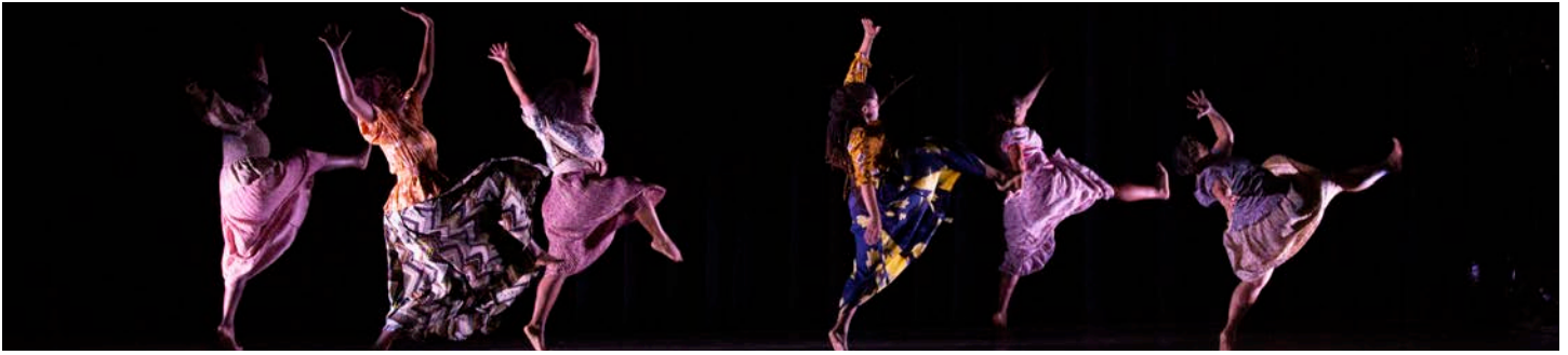
Mojuba Dance Collective