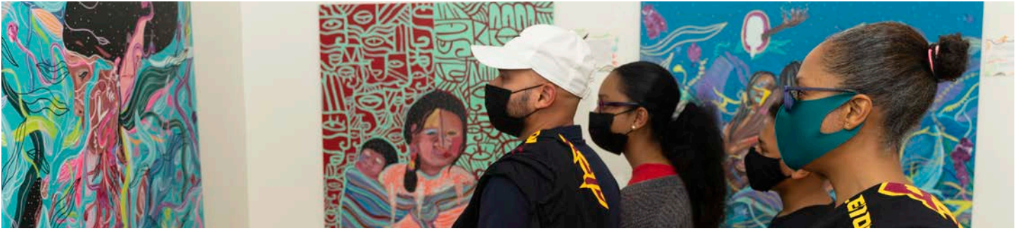
Julia de Burgos Cultural Art Center