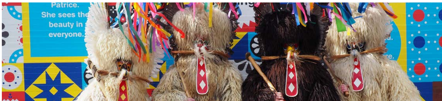
Slovenian Museum and Archives - Cleveland Kurentovanje Festival